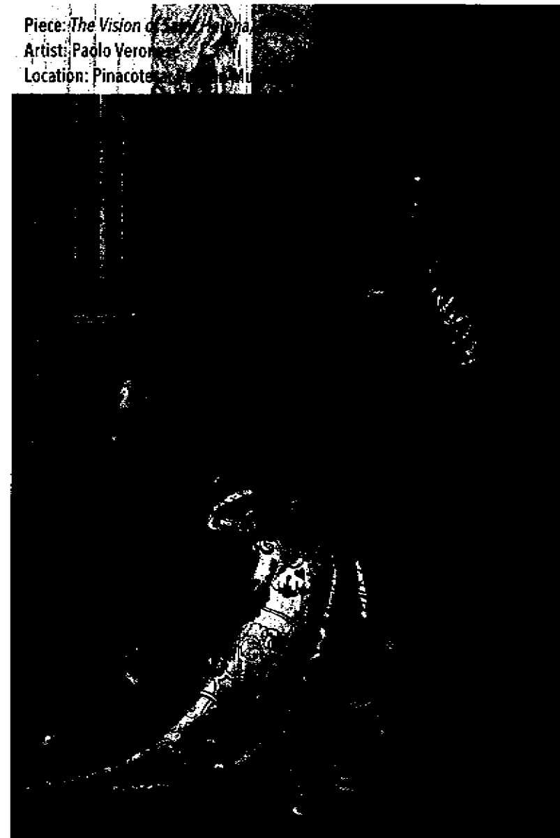
Piece: The Vision of Saint Helena Artist: Paolo Veronese Location: Pinacoteca